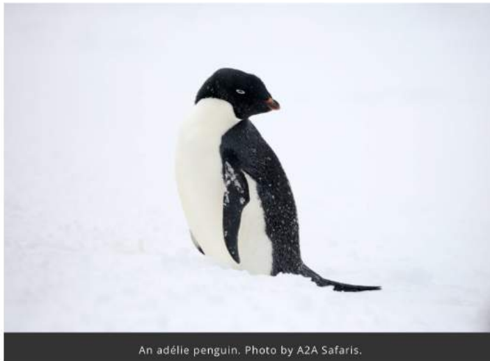
An adélie penguin.

Antarctic scientists made an incredible discovery by looking at poop stains in satellite images – 1.5 million Adélie penguins were thriving on a little patch in Antarctica surrounded by treacherous sea ice called the Danger Islands. It turns out these elusive birds had lived on the islands undetected for al-